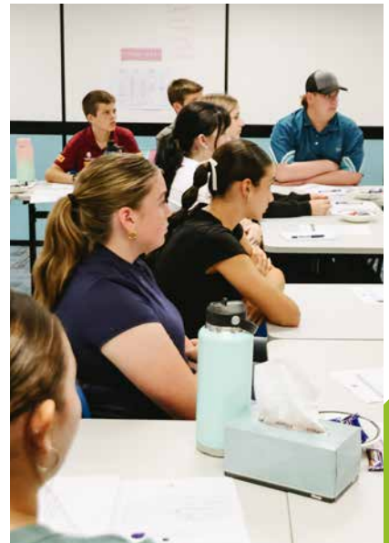
Students from Dysart and Moranbah State High Schools discussed future plans for themselves and their communities at the first meeting of the Youth Advisory Council 2025.

“What a fantastic opportunity and an exciting year ahead for you all.”