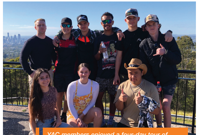
YAC members enjoyed a four-day tour of Brisbane in July, investigating jobs of the future.

Highlights of the year for the 2023 YAC members included tours of Goonyella Riverside Mine and the IROC facility in Brisbane.