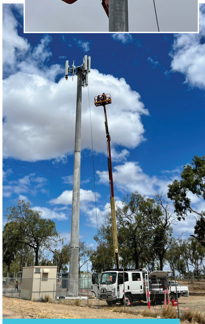
A work crew wired the new Moranbah tower in mid-October.