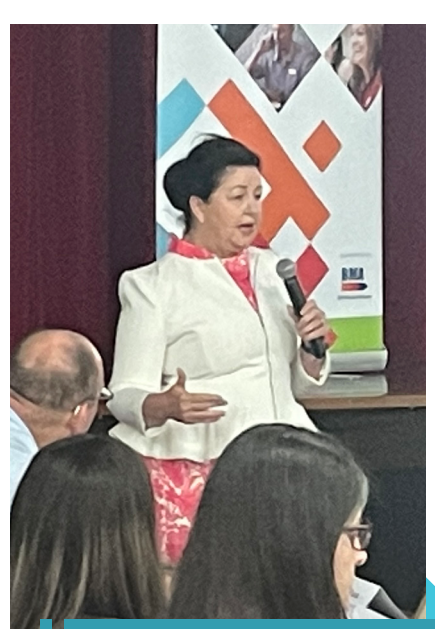
Isaac Mayor Anne Baker welcomes participants to the Smart Transformation Housing Summit.